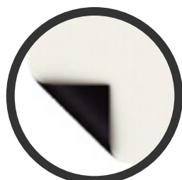
MATTE WHITE SCREEN - BLACKOUT (COSTAS PRETAS)