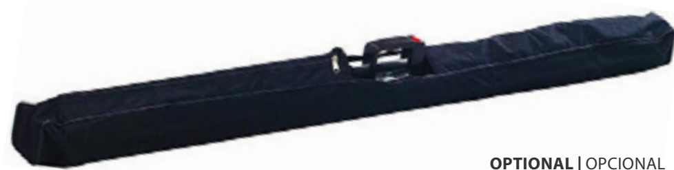
OPTIONAL | OPCIONAL CARRYING BAG FOR TRIPOD SCREENS BOLSA DE TRANSPORTE PARA ECRANS DE TRIPÉ